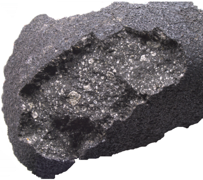
Fig. 1. Fragment of Maribo showing fusion crust and exposed interior. Field of view is 16 mm.

sections are now on deposit at the NHMD . One thin section is on deposit at UM .